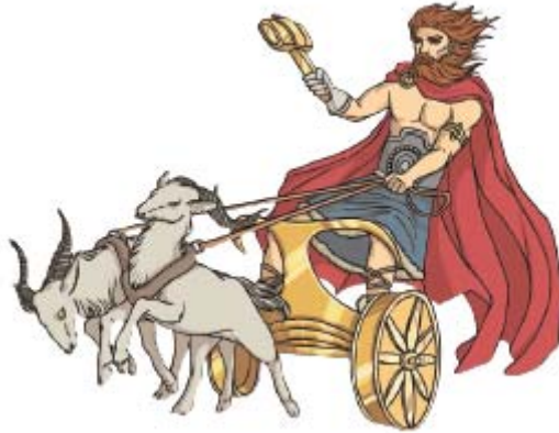
This is the Anglo-Saxon god Thor.

Homework books must be in school on Monday and it will be returned on Tuesday