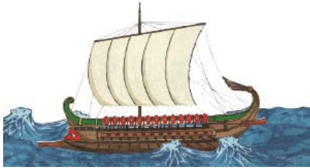
A Roman galleon (ship)

Homework books must be in school on Monday and it will be returned on Tuesday