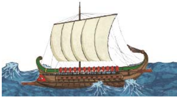
A Roman galleon (ship)

Homework books must be in school on Monday and it will be returned on Tuesday