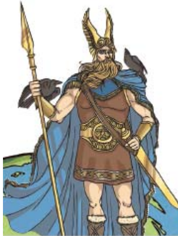
This is the Anglo-Saxon god Odin.

Homework books must be in school on Monday and it will be returned on Tuesday