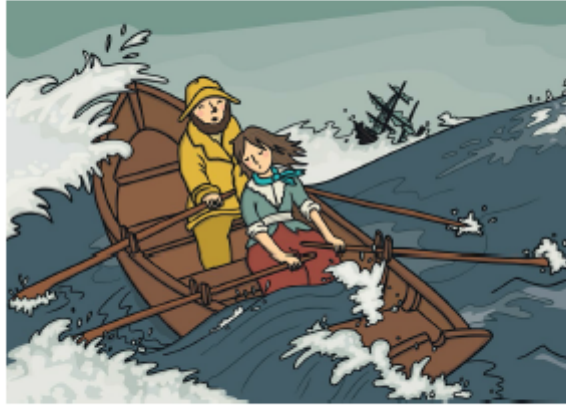
Grace and her father rowing through the storm towards the boat which had crashed into rocks.