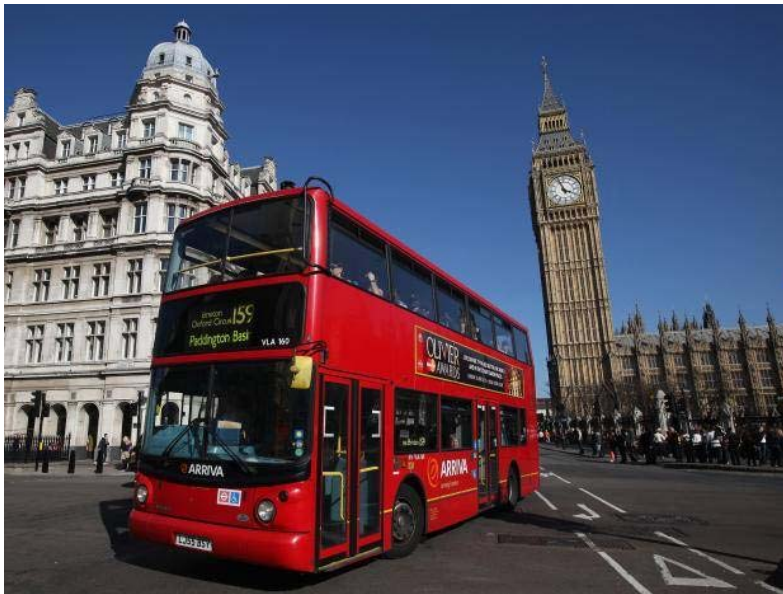
London bus and Big Ben