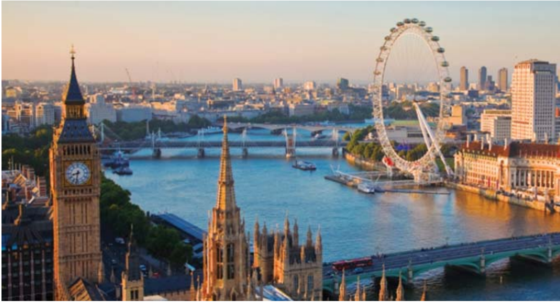
The River Thames