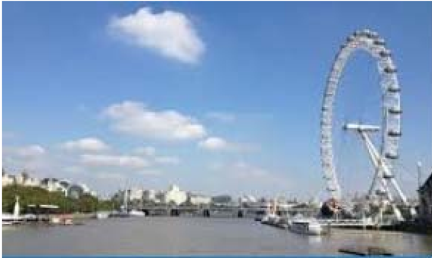
The London Eye and the River Thames