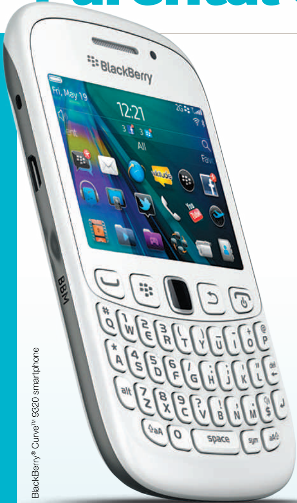
BlackBerry® Curve™ 9320 smartphone

Parental Controls are designed to help you have more control over how the features of the BlackBerry® smartphone are used.