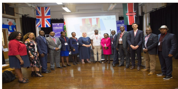
The dignitaries all enjoyed their visit.

Thanks to technology we were also joined by our partner school by Skype. This meant that teachers and pupils in both schools were able to hear Peter Tabichi as he talked about his award: how he had won it and what the future held. There were some top tips for teachers and pupils too.