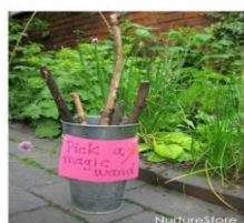
how to make a beautiful MAGIC FAIRY WAND

Find a wand in your garden or outside and use it to write spells and sounds in the soil or in the air.