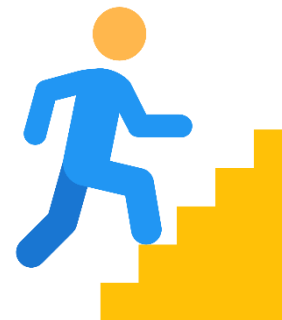
Running & Walking up and down stairs/ steps.