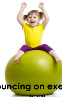
Bouncing on exercise ball