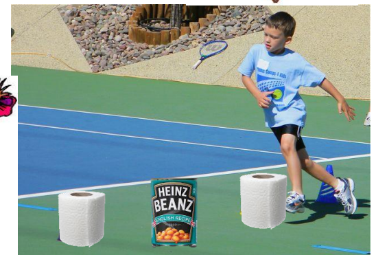
Running & Walking between toilet rolls or cans.