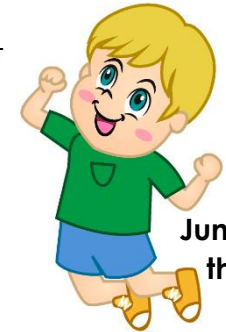
Jumping on the spot