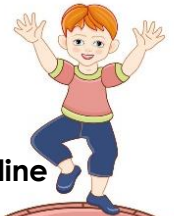
Jumping on trampoline