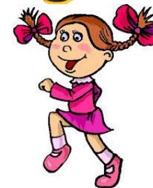
Running on the spot