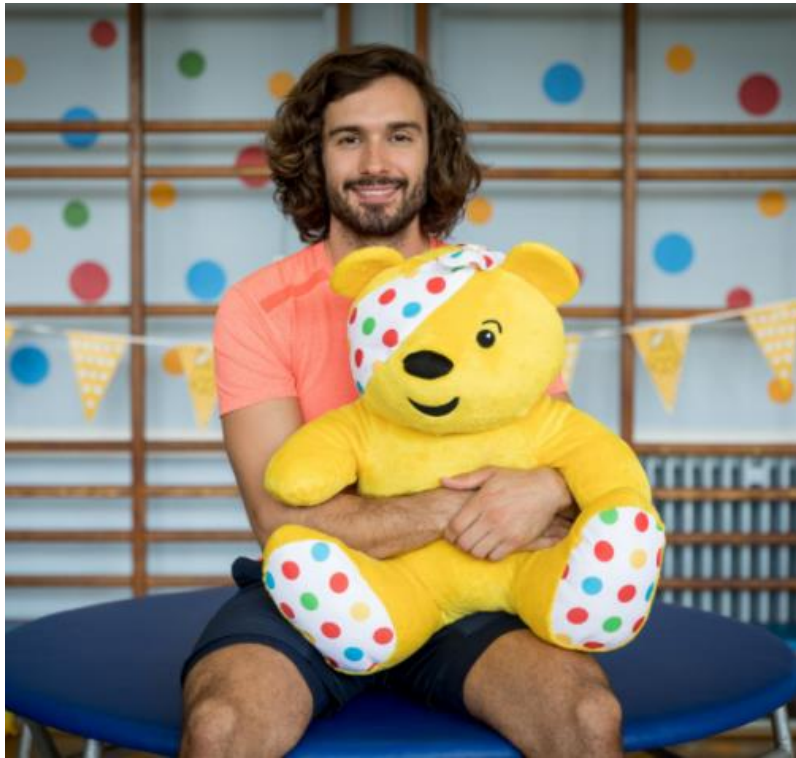
Joe Wicks with Pudsey Bear from BBC Children in Need