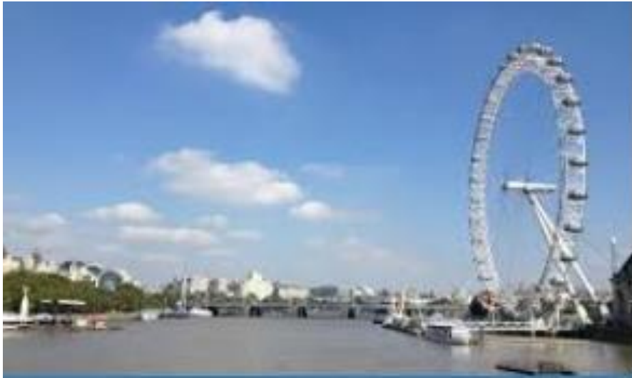
The London Eye and the River Thames