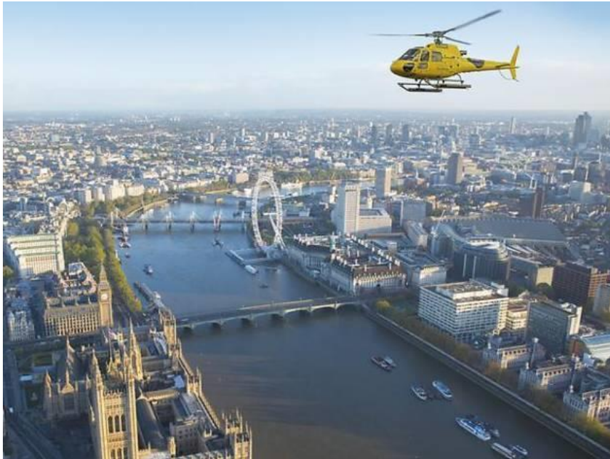
A helicopter over the River Thames in London